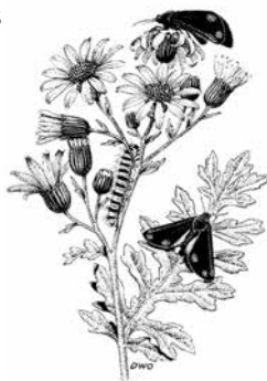
Ragwort and Cinnabar Moth

Strangely the best way to control ragwort is to let it flower (the parent plant then dies) and to manage grassland carefully to avoid creating bare ground where the seeds can germinate. Pulling it may leave roots which re-grow and cutting