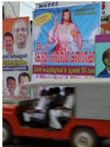
One of our many partners in the Seven Year Plan is the Church of South India, in Kerala, which is addressing its transport and energy use, and promoting sustainable lifestyles.