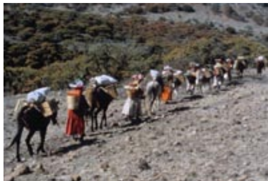
Top: Mongolian monks bless a new stupa marking sacred land. Below: Each year the Mexican Huichol people make a 400 mile pilgrimage to the sacred Huiricuta "Field of Flowers" mountain. ARC has helped them protect this fragile landscape; its wildlife, plants and secret places.

Some of these old documents taught which mountains, forests and valleys were sacred and should therefore be protected. In partnership with the monasteries and with the World Bank, ARC helped rediscover these and translate them into modern Mongolian. Sometimes the wisdom is proven anew: on one mountain for example, people were told that if they removed the trees "the goddess" would flood their village. Recently, ecologists have concurred that this particular mountain has a fragile ecology, and logging it would threaten the water table - resulting inevitably in flooding.