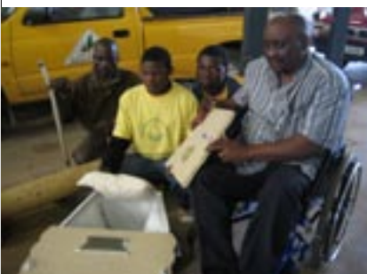
Workers demonstrate a model eco-coffin in South Africa.

Our website, www.arcworld.org , is updated regularly, has thousands of visitors a day, and has - we are told - been an inspiration to a variety of faith groups, secular groups and individuals looking for examples of faiths engaging actively in the environment.