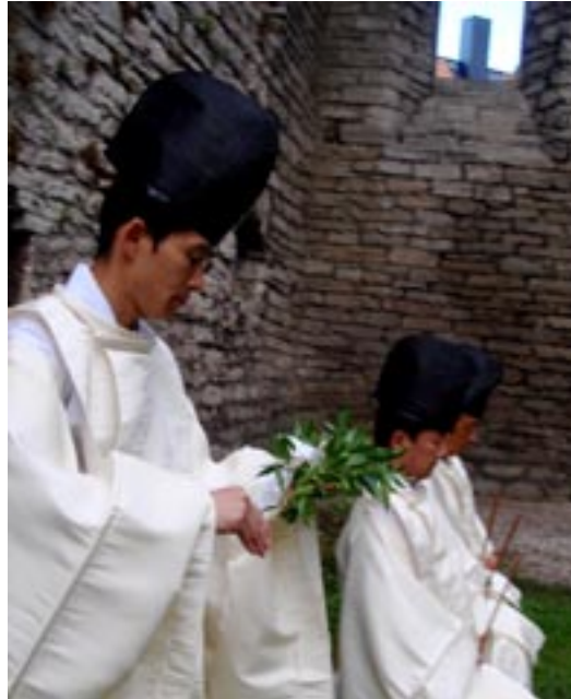
The Shinto of Japan believe they are protected by trees, and that they should therefore respect the power of forests and manage their own forests responsibly. The photo was taken at a ceremony in Visby, Sweden in honour of ARC's Faiths and Forests initiative.

This has created a surprising momentum, with an array of forest owning groups from other religions - as well as several secular bodies - joining the project. The aim is to have 80% of such forests signed up to RFS by the time the great wooden Shinto shrine of Ise, Japan is rebuilt in 2013 - an event to which the Shinto are inviting all forest-owning religions.