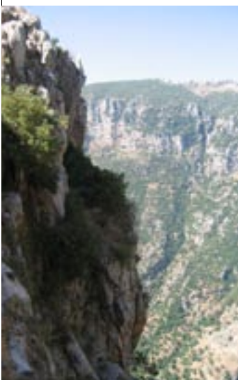
The Qadisha Valley in Lebanon, traditional place of hermits and now a faith-protected landscape.

The forest of Harissa climbs steeply above the busy town of Jounieh, just north of Beirut. For more than 1000 years it has been virtually undisturbed, supporting a few orchard owners and plenty of plants and wild animals. But after the civil war of the 1980s, the developers started moving in with concrete and bulldozers, threatening this last green coastal space in the region, named by WWF one of the top 10 "Forest Hot Spots" in the Mediterranean. At its heart is the Maronite Church's Shrine to Our Lady, and her statue towers over the forest, which is perhaps appropriate